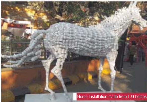
Horse Installation made from L.G bottles

LG HING THANKS MUMBAIKARS FOR THEIR OVERWHELMING LOVE AND SUPPORT AT HT KALA GHODA ARTS FESTIVAL 2017. WE PROMISE TO KEEP ADDING TADKA TO YOUR LIVES!