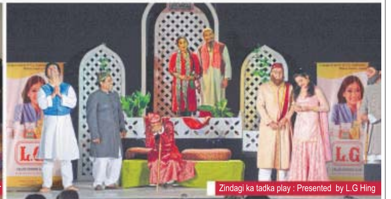
Zindagi ka tadka play: Presented by L.G Hing