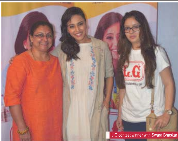
L.G contest winner with Swara Bhaskar