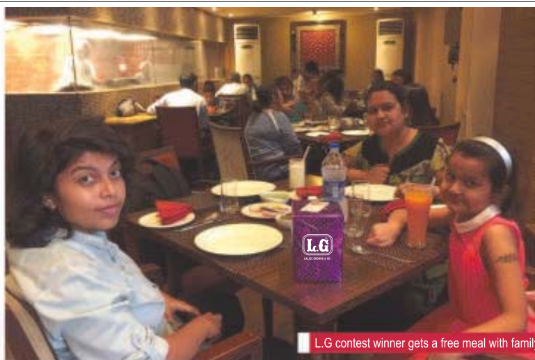
L.G contest winner gets a free meal with family